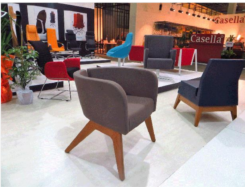
Occasional seating from Sofa

Finally, we felt we needed to share this, without comment, from