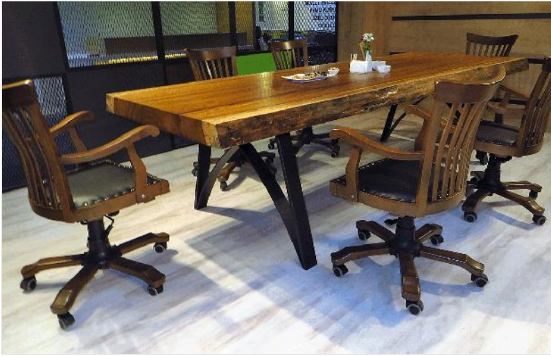
West African oak table from Willowy.