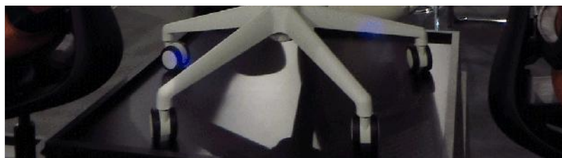
Rapido task chair