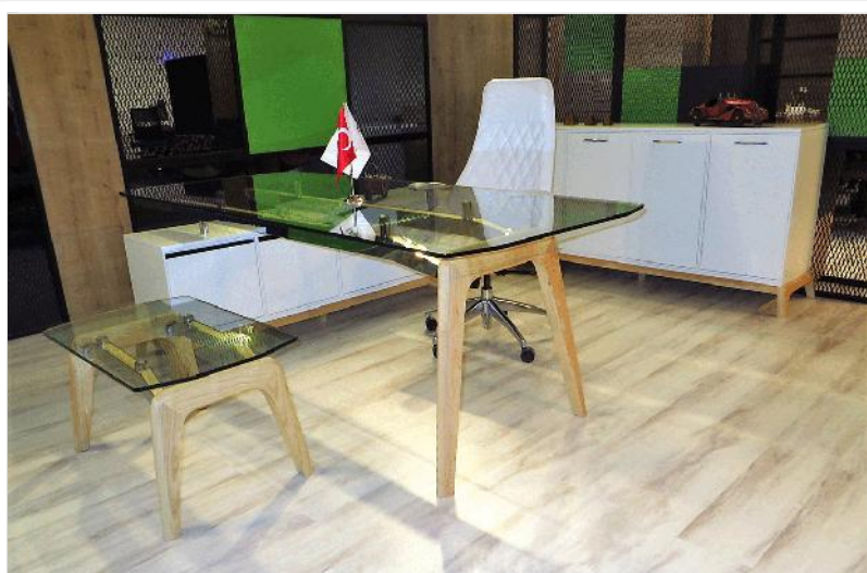
Willowy executive glass and timber desk.

Willowy were an interesting new company from Bursa with an inviting and attractive stand.