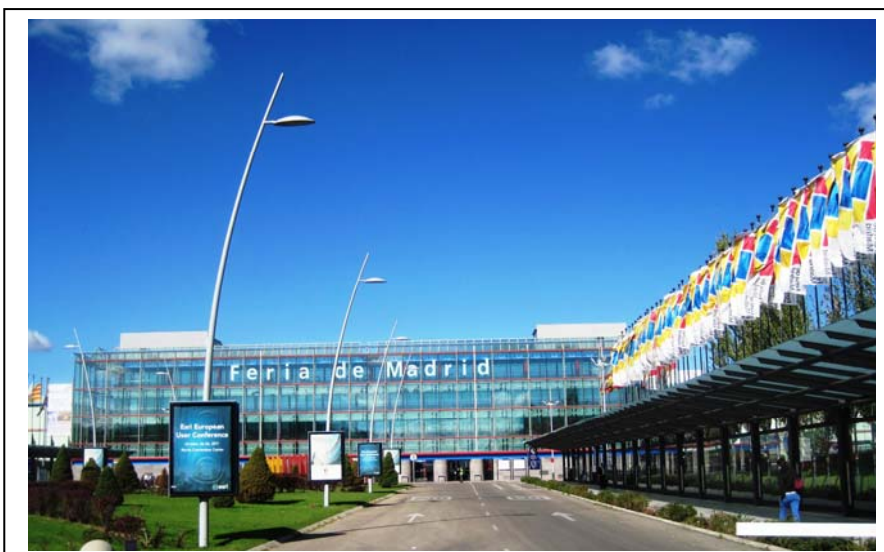
Feria de Madrid

The show was held in the Feria de Madrid, one stop from Madrid Airport, on the super fast and spotlessly clean Madrid Metro. The centre itself is extremely modern and very large - 200,000 sq m - and made up of 12 exhibition halls and conference centres allowing several shows to be held concurrently, creating a nicely buzzy atmosphere.