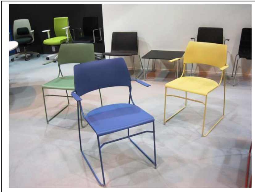
Ados from Akaba

Akaba from the Basque region in the north of Spain showed Ados designed by Miguel Angel Ciganda. A pretty injection moulded and steel chair, stacking up to 55 high and with optional arms and a trolley, the chair was shown in a range of bold, challenging colours.