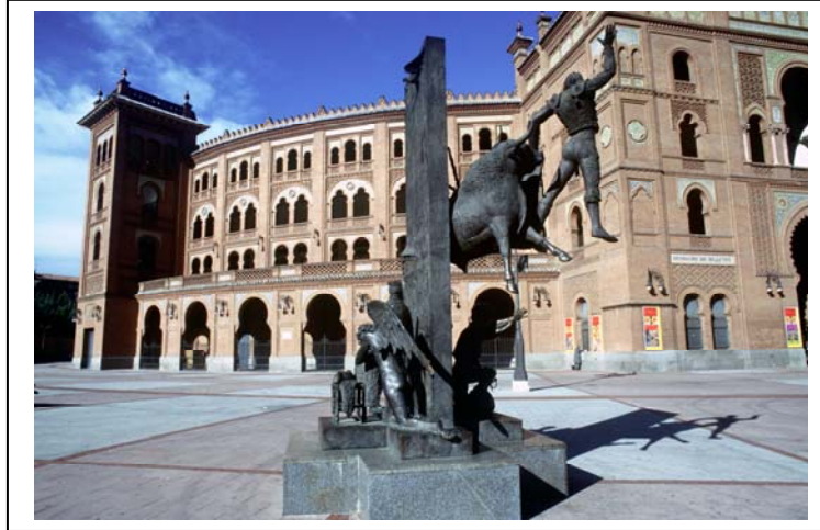
Las Ventas bullring, Madrid

Visitors to Madrid for the OFITEC show were blessed with sunshine and showers, some torrential. It was however pleasantly mild and coats, scarves and hats remained generally unworn. The city is large, with great mixture of well maintained and attractively presented traditional buildings - and some stunning modern architecture. Full of world class art galleries and museums, great restaurants and tapas bars, it's a place where the senses can easily reel. Be prepared for late nights though; restaurants rarely open before 9pm and stay crowded until the early hours. "Going on" to a club or flamenco bar can mean greeting the dawn.