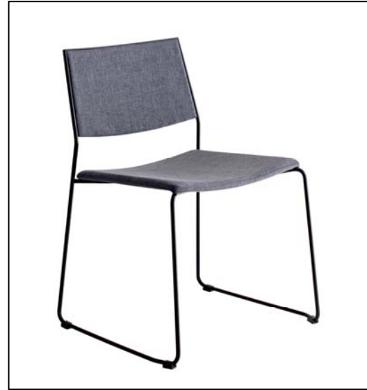
May from Inclass

They also showed May by Frances Rife which featured a steel rod frame in black, white, silver or chrome and a variety of finishes for its seat and back.