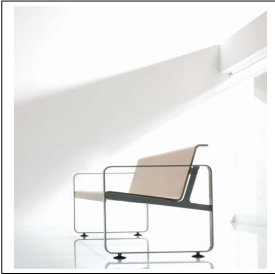
Neos from Inclass