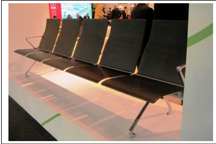
Steel beam seating from Actiu

The only true breakout seating on show – the concept has yet to catch hold in Spain – came from the Portuguese company, Guialmi